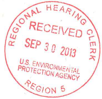
EXHIBIT A WORKPLAN